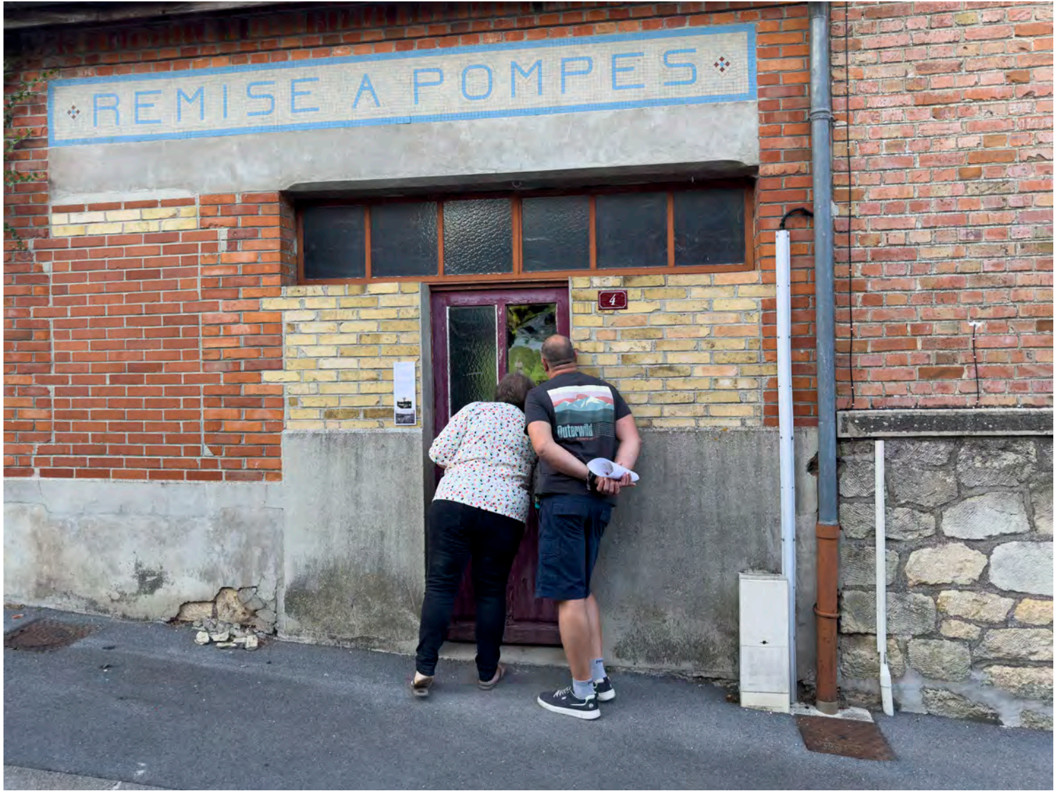
Installation at former public shower block: Immersion, 2024 Rotated video self-portrait, in the River Aire at the atardeau (with sound, 25s, looped)