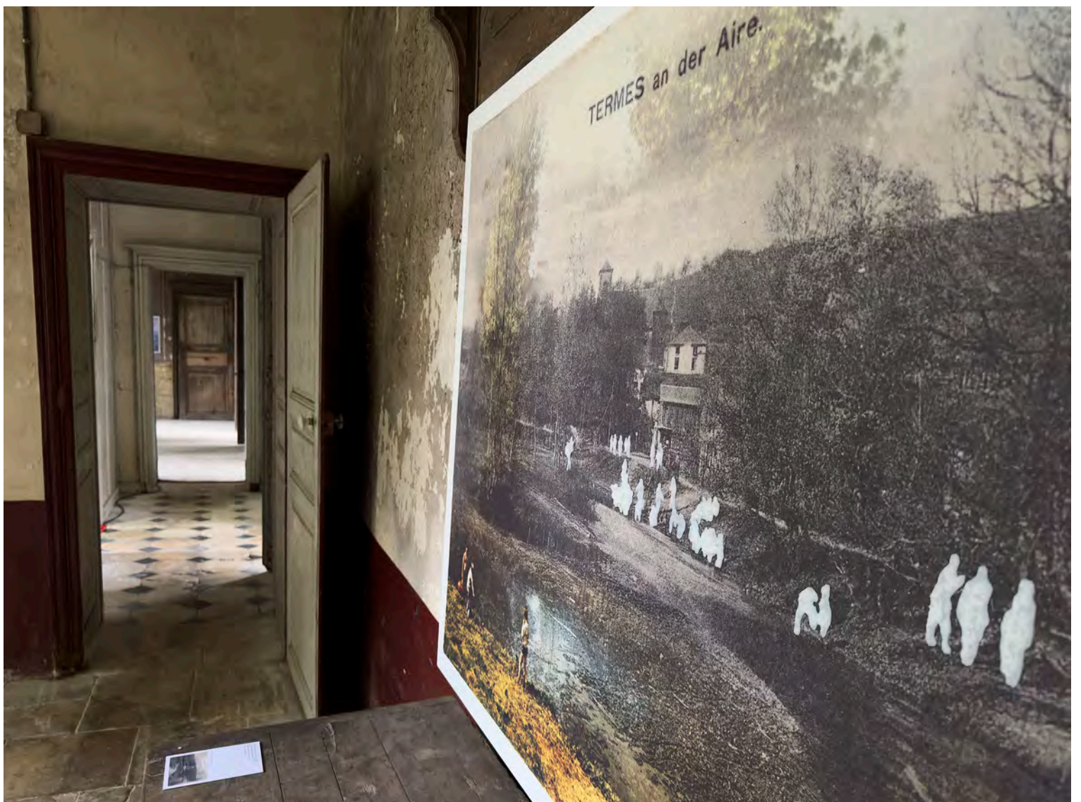
Fabric Print #3, 2024 Digital collage, 3D printed figures In collaboration with Jeffrey Knopf