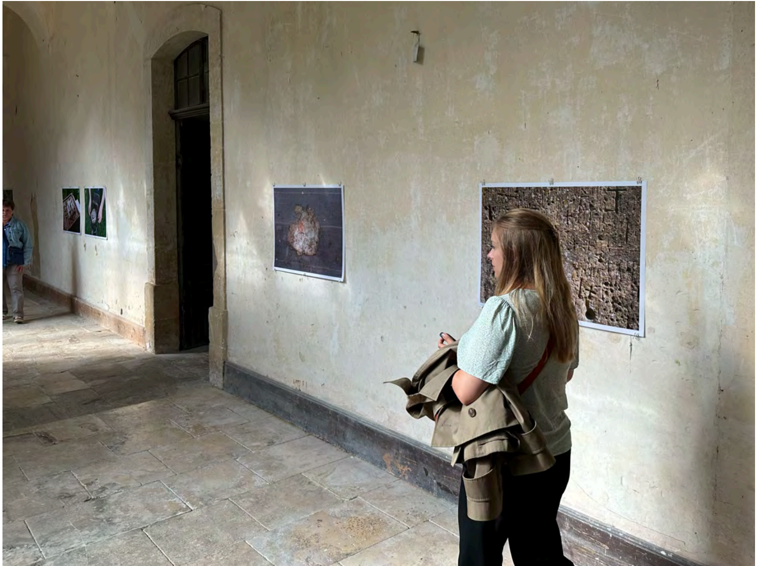
Abbey, main corridor: Colour photographic works from La Vojo Returne series 2022-25 610mm x 890mm, archival HP Satin Pro 300gsm