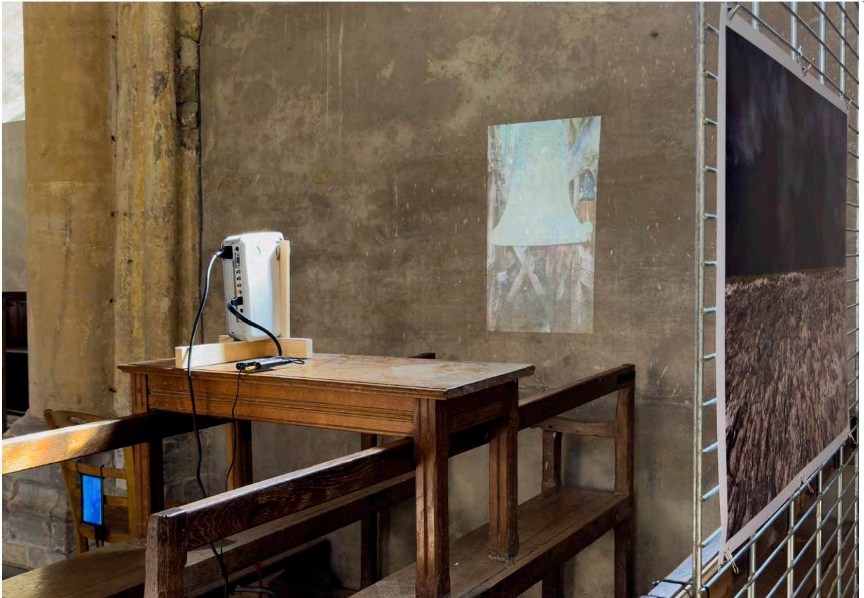
Intervention: pews, table, monitor, projector and media players A spiral of cleaning, 2025 featuring resident François Depaix, clearing the spiral staircase of St Medard church bell tower (with sound, 2m 3s, looped) Untitled, 2024 3D 'splat' LIDAR scan of St Medard church bell (24s, looped)