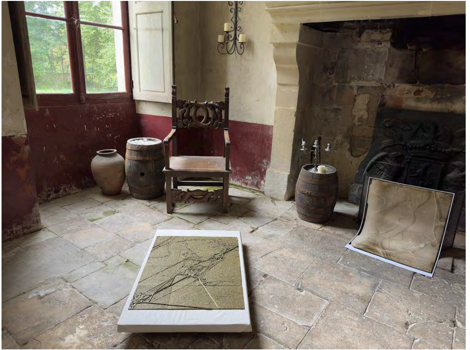
Room I, installation detail: Untitled floorpiece II, 2025 3D printed WWI French aerial reconnaissance photograph In collaboration with Jeffrey Knopf