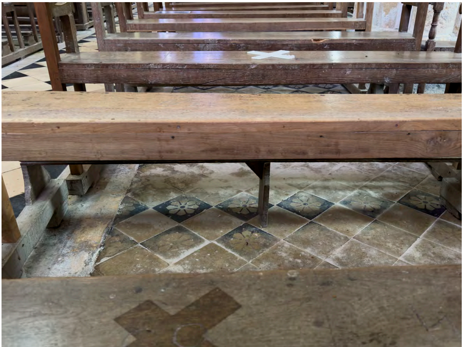
↓ Cross, 2025 3D printed COVID cross 3D printing in collaboration with Jeffrey Knopf