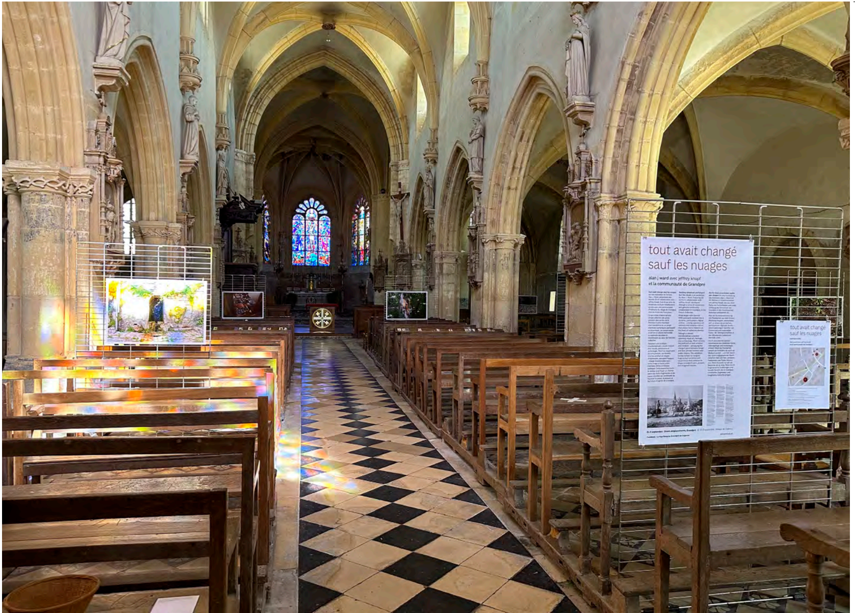
St Médard Church, Grandpré: Colour photographic works from La Voie Returne series 2022-25 Various sizes, archival HP Satin Pro 300gsm