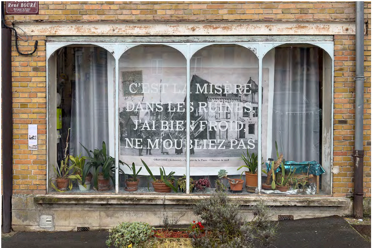
↑ Installation in window of No. 1, Place de René Bouré, (corner of Grandpré square): Large site-specific paper print of post-war postcard with white emulsion text, extract from reverse of postcard