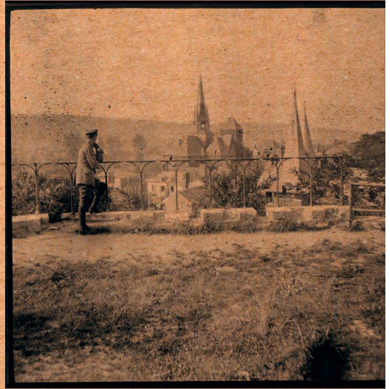
nothing remained unchanged but the clouds

selected exhibition photographs abbey of notre dame de chéhéry, ardennes 20-21 september 2025