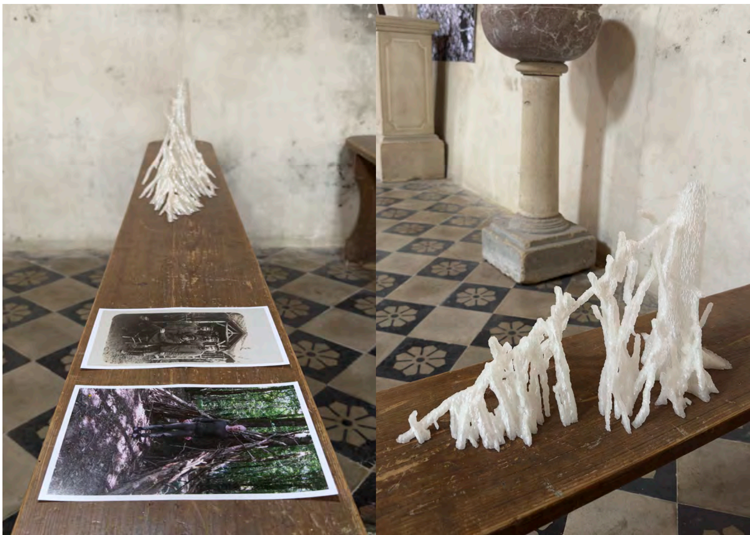
↓ Temporary structure, 2025. 3D scanned and printed local primary school building project, German post, and 'self-portrait' photographic print. 3D printing in collaboration with Jeffrey Knopf