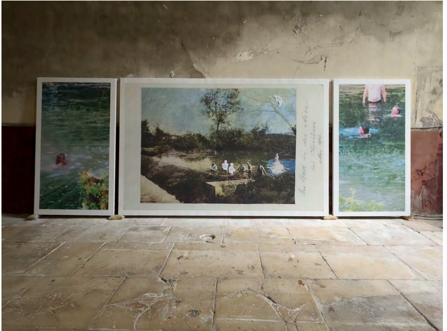
Room I, installation detail: Fabric Print #2 triptych, 2024 Digital collage, 3D printed figures In collaboration with Jeffrey Knopf