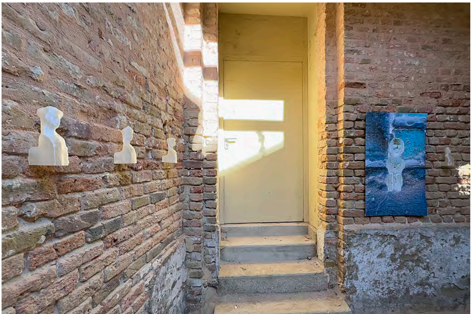
↓ Installation below village tower: Four brothers and a sister, 2025 Inverted colour photographic print on fabric, four enlarged 3D LIDAR scanned and printed window shutter catches, from Rue des Quatre Frères Tellier 3D printing in collaboration with Jeffrey Knopf