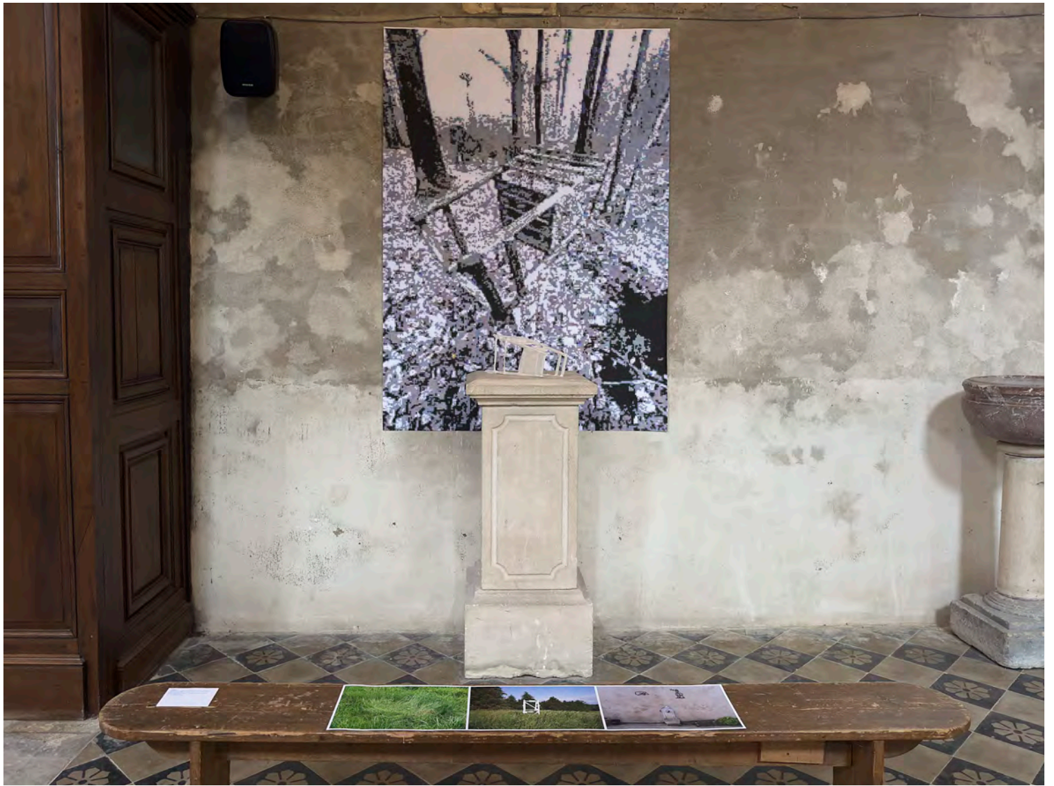
↑ Fallen, 2025 3D LiDAR scanned and printed shooting platform, digital pixel print on paper, photographic triptych from La Vojo Returne series with white oil stick 3D printing and paper pixel print in collaboration with Jeffrey Knopf